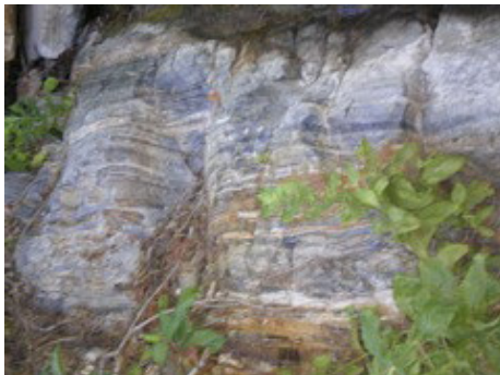
Interesting Outcrop Patterns on Mt. Baldy